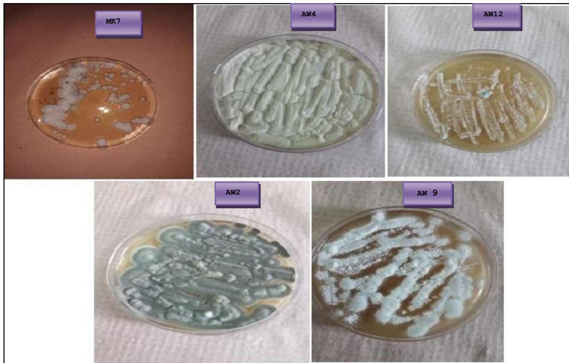
Fig (2): Local Actinomycetes Spp. Isolate grow on on glycerol yeast extract agar (GYEA) for 10- 12 days