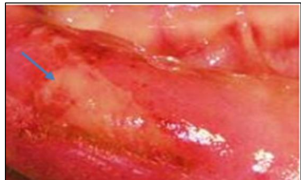
Figure 5: Recurrence at 1 month

The suggested diagnostic hypotheses for this clinical picture were: recurrent oral aphthosis, cyclic neutropenia, vitamin B12 deficiency. Further investigations were made and the hematologic bilan revealed megaloblastic anemia (Hb: 11 g / dl, VGM: 110fl) and neutropenia at 750 / mm 3 . The serum vitamin B12 value was 135 pmol / L and 132 pmol / L, respectively, at the first and second doses.