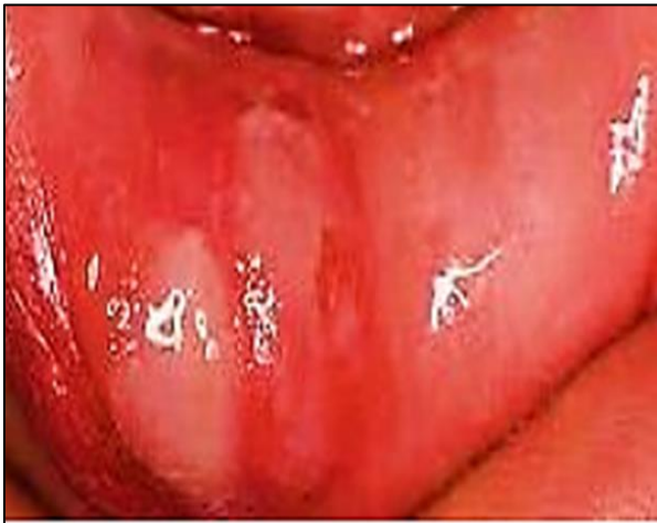
Figure 1: Ulcerations of the lower half-lip

lesions were oval, jagged edges with a granular bottom, and hollowed and covered with a whitish coating. They rested on an inflammatory nodule which extended away from the ulcerations (Figure 1).