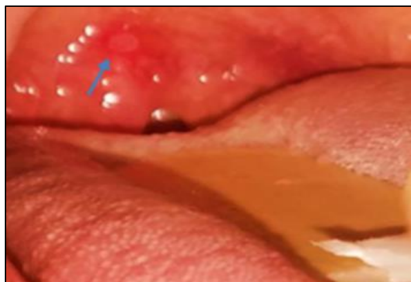
Figure 3: Ulceration of the uvula

The lesions disappeared three weeks after local symptomatic treatment (mouthwashes based on chlorhexidine gluconate 0.2%) and submucosal injections of Betamethasone.