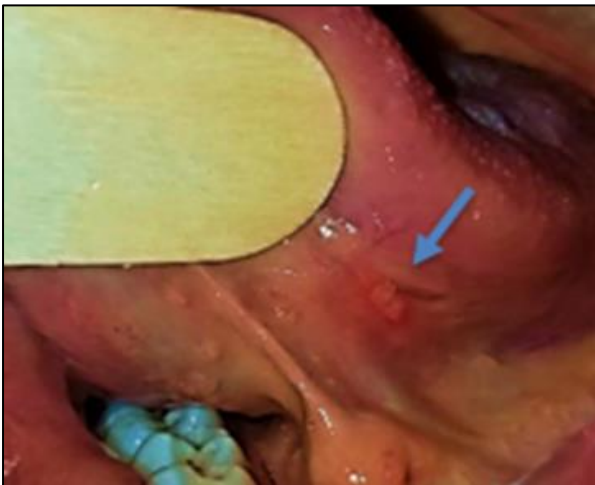
Figure 2: lingual ulceration

Other ulcerations were found on the ventral side of the tongue and uvula with the same characteristics. No examination was undertaken to find the etiology due to the patient's financial arrangements.