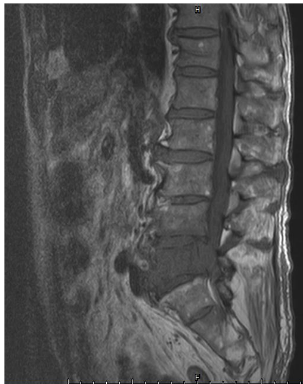
Fig. 2 pre-operative T1 image