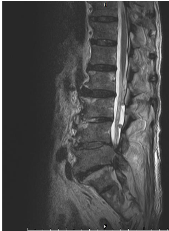
Fig. 3 pre-operative T2 image