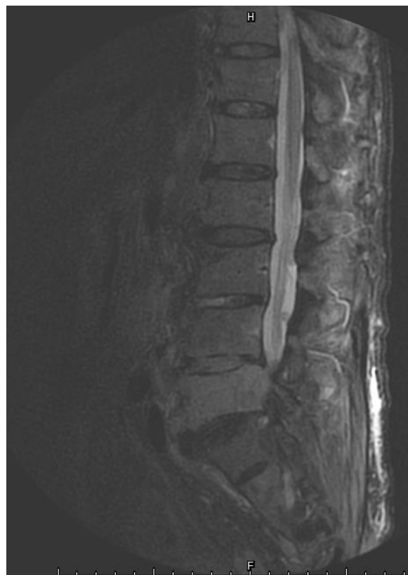
Fig. 4 pre-operative STIR image