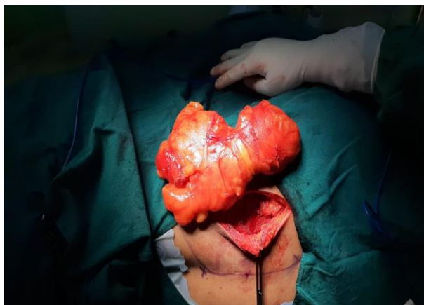
Figure 2 showing intraoperative picture of the Giant lipoma