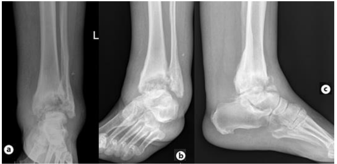
Figure 1: (a) anterior to posterior, (b) mortise, and (c) lateral plain radiographic films demonstrating severe destruction of tibiotalar joint and subtalar arthrosis

On physical exam, her left foot and ankle were markedly limited to range of motion secondary to pain. She was able to demonstrate motor function in all myotome distributions and severely diminished sensory to the foot and ankle to the level of about 10 cm proximal to the tibiotalar joint. Her legs were darkly discolored with 3+ pretibial pitting edema consistent with chronic vasculopathy. Plain radiograph films of the left foot and ankle were obtained which showed extensive destructive changes at the level of the tibiotalar, subtalar joints. Talar collapse, obliteration of the tibiotalar joint, and persistent soft tissue swelling were noted with no acute obvious fractures of the left foot. The conclusion upon physical examination and radiographic analysis was consistent with type II diabetic Charcot osteoarthropathy with acute destruction to the tibiotalar and subtalar joints (Figure 1).