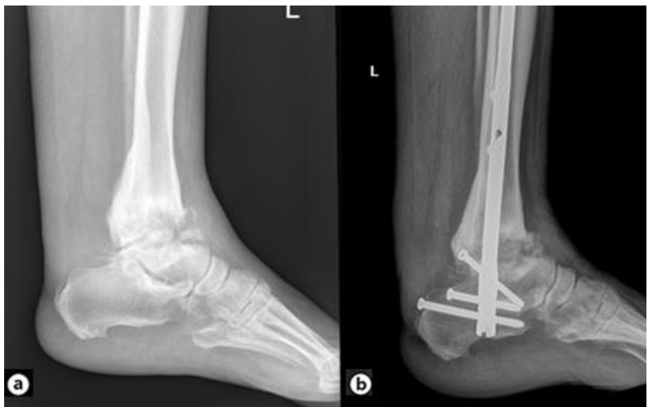
Figure 3: (a) Pre and (b) post-operative lateral plain radiographic films demonstrating recovering soft tissue contours, muscle striations, and soft tissue planes.

90% due to infection, hardware failure, pseudoarthrosis, or malunion (Caravaggi, C. et al. , 2006).