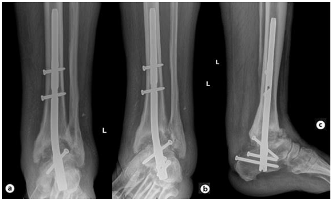
Figure 2: (a) anterior to posterior, (b) mortise, and (c) lateral plain radiographic films demonstrating intact tibiotalocalcaneal hindfoot fusion nail without hardware failure.

fusion nail was inserted in traditional technique with two 6.0 locking screws in the calcaneus, one 5.0 screw in the talus, and two 5.0 screws in the tibia, all engaging the nail and securing in multiple planes. All screws were inserted through 1 cm percutaneous incisions, with placement visualized and verified under low dose fluoroscopy. The wound construct was then thoroughly irrigated and closed in sterile fashion. A short leg plaster splint was then placed. Discharge plan included remaining non-weight bearing on operative limb with use of assistive walking devices. Upon first post-op visit, patient was elated and noticed an immediate reduction in pain from her preoperative symptoms. Incisions were healing uneventfully, and she was placed in a walking cast and followed up two weeks later for suture removal and cast replacement. At the second post-op visit, patient continued to deny constitutional symptoms and major concerns. Three x-ray views were obtained, demonstrating intact hardware without failure (Figure 2). The patient was instructed to follow up in 3-4 weeks for cast removal, x rays, and transition to a walking boot.