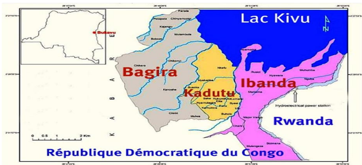
Fig1: Map of the area study: Bukavu city including the district of Bagira (pgkivu.blogspot.com, 2019)

The study was carried out in the Democratic Republic of Congo, Province of South Kivu, in Bukavu city-Bagira, on the hill sheltering the Bwindi Institute, a school of the Community of Free Churches of Pentecost in Africa in the experimental fields of students of the Agricultural Technical Section. The geographical coordinates of the hill are as follows: 1500 m.a.s.l, 28 ° 50 'E and 2 ° 30' S. The map of the Bukavu city, including the district of Bagira is illustrated in the figure 1.