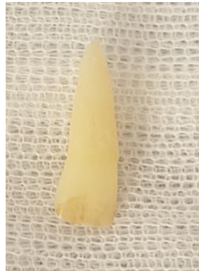
Fig-3: Clinical aspect of the avulsed tooth

After the examination, the treatment guideline for avulsed permanent teeth with closed apices and prolonged extraoral time were followed.