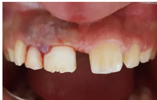
Fig-7: Tooth replanted in socket