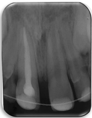
Fig-10: Periapical radiograph after immediate replantation of avulsed tooth