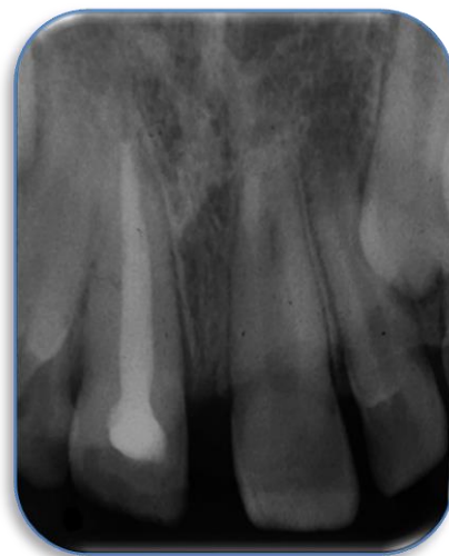
Fig-8: Periapical radiograph showing that the tooth was correctly positioned in the socket