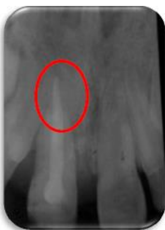
Fig-11: Periapical radiograph after 18 months follow up: Resorption is limited at apical third