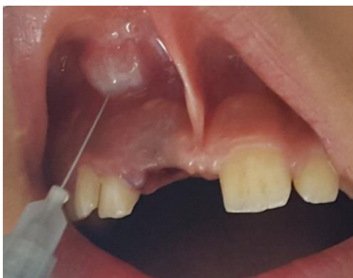
Fig-5: Local anesthesia administered

During the 12-month follow-up, clinical and radiographic examinations showed satisfactory functional and esthetic values for the avulsed tooth but some initial replacement root resorption was developed later (Figure 11).