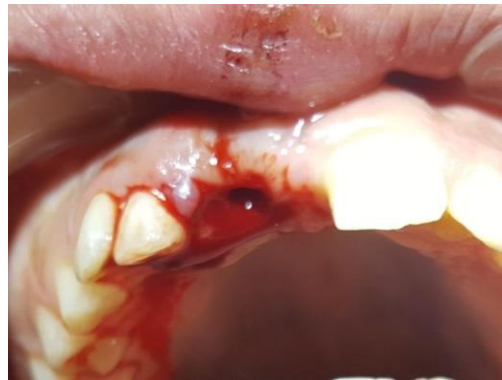
Fig-6: Alveolar socket debrided