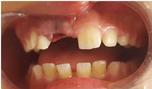
Fig-1: Preoperative intraoral photograph – Avulsion of the right upper incisor

The examination of avulsed tooth revealed that the root had a closed apex, and the root surface was covered with dirt and dried remnants of necrotic periodontal tissue. (Figure 3)