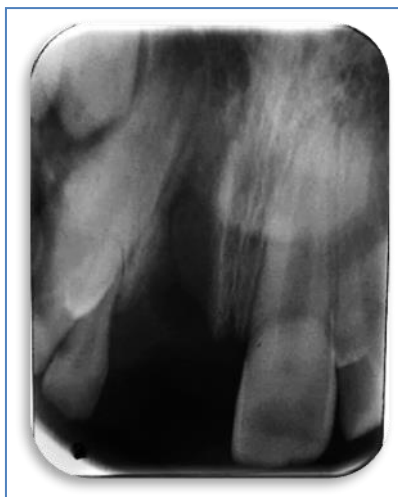
Fig-2: Pre-operative intraoral periapical radiograph showing extensive bone loss