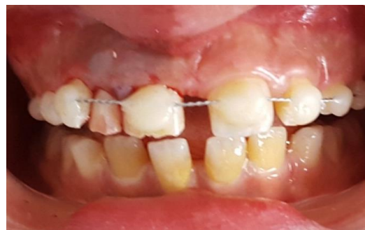
Fig-9: Splinting of the avulsed tooth with orthodontic wire and composite resin