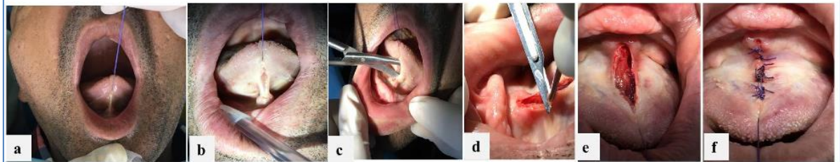
Figure 3 : (a) Traction sutures at the tip of the tongue, (b) Horizontal incision of frenum, (c) Horizontal incision of frenum, (d) Submucosal dissection, (e) transverse incision of frenum, (f) Diamond shaped wound post frenulum excision and Interrupted sutures.