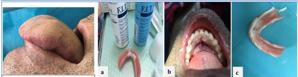
Figure 4: An immediate improvement in protraction after treatment