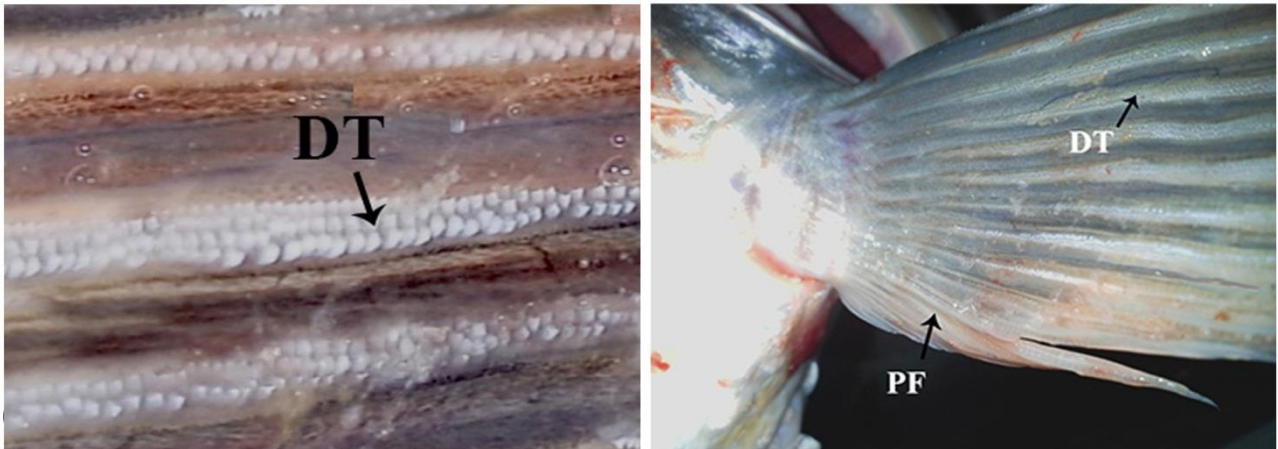
Fig. (1): A photo macrography picked up by using a camera showed the deciduous tubercles (DT) (pearl organs) on the dorsal and medial surfaces of the pectoral fins (PF)

Fig. (1) as mentioned by Rashid et al. , (2014).