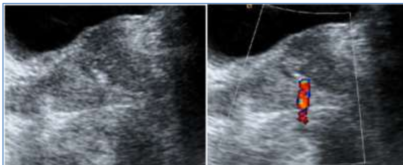
Fig-2: Ultrasound appearance of prostatic calcifications.