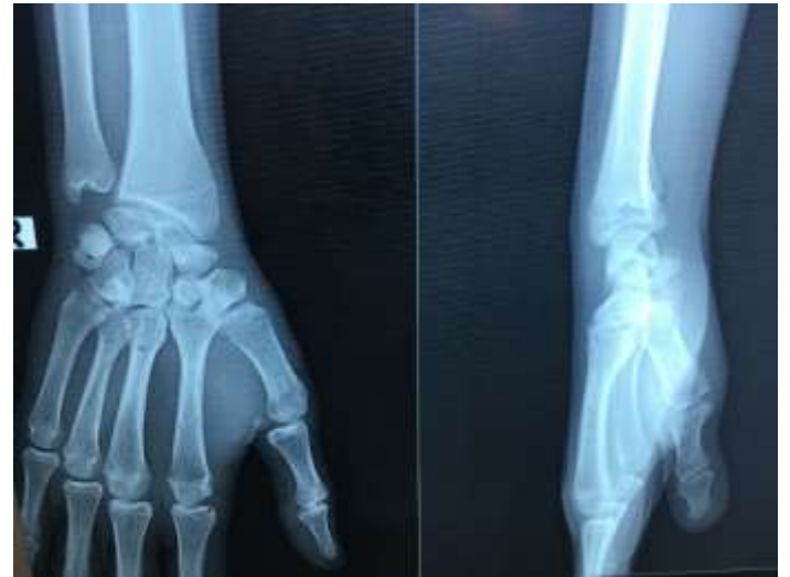
Fig-5: Radiological control after removal of material objectifying good articular congruency at the carpometacarpal joint of the thumb