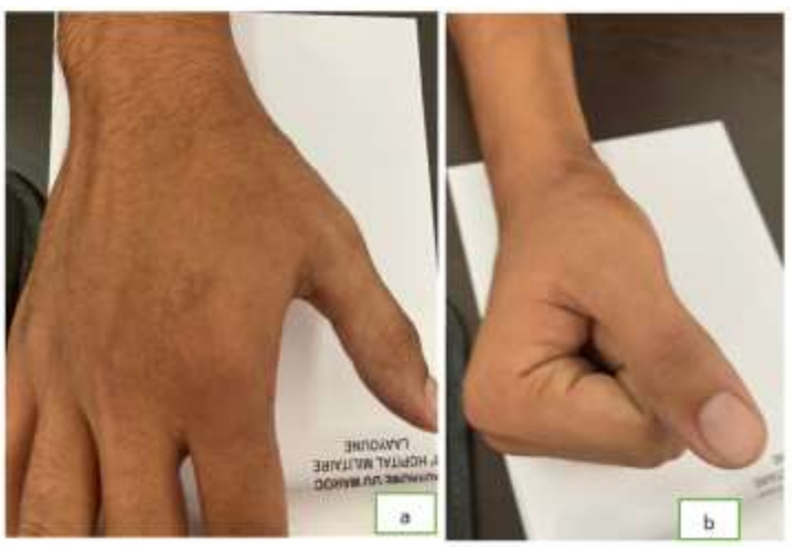
Fig-4(a, b): Postoperative result showing the proper recovery