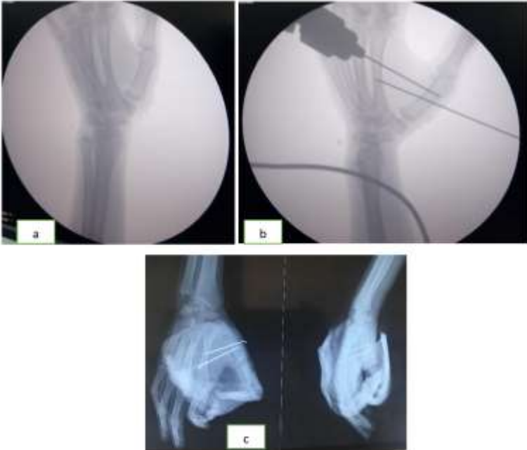
Fig-3(a, b, c): Kirschner wires fixation of first commissural space (ISELIN technique). X-ray appearance