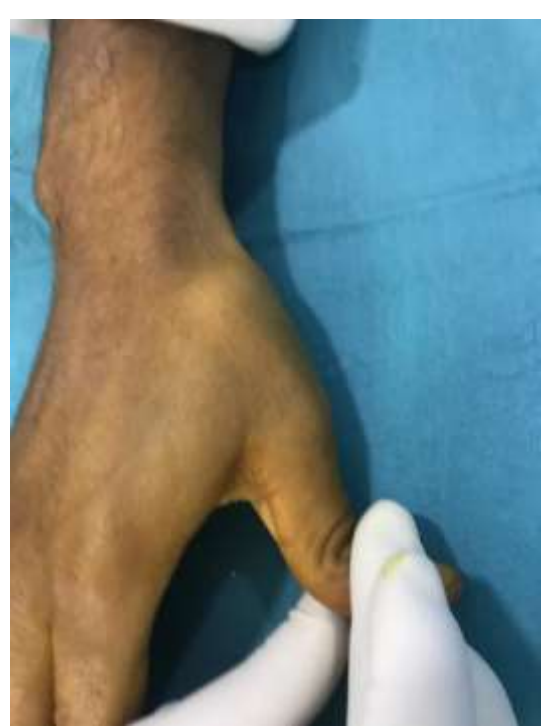
Fig-1: Clinical aspect revealing provoked trapeziometacarpal dislocation

postoperatively, at the periodic consultations and at the radiological follow-up, the patient had no recurrence with comfortable function of the hand (Fig 4 and 5).