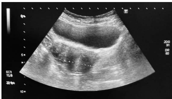
Fig-1: Grayscale imaging showing a uterine fibroid (measuring 2.8 x 2.8cm) seen at cervix.

In present study, fibroids were reported to be the most common organic cause of abnormal uterine bleeding, comprising 25% of the cases (Figure 1). A study conducted by Sakshi Daga and Suresh Phatak in 2020 concluded fibroids as the major cause of abnormal uterine bleeding seen in 39.44% of the cases [8]. Bhosle and Fonseca also revealed fibroids as the most frequently seen abnormality accounting for 47.3% on ultrasonography in peri-menopausal women [8].