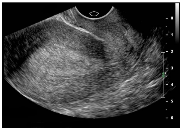
Fig-2: Transvaginal Ultrasound showing thickened endometrium (measuring 20mm) suggestive of endometrial hyperplasia

In present study, fibroids were reported to be the most common organic cause of abnormal uterine bleeding, comprising 25% of the cases (Figure 1). A study conducted by Sakshi Daga and Suresh Phatak in 2020 concluded fibroids as the major cause of abnormal uterine bleeding seen in 39.44% of the cases [8]. Bhosle and Fonseca also revealed fibroids as the most frequently seen abnormality accounting for 47.3% on ultrasonography in peri-menopausal women [8].