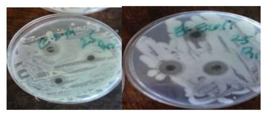
Plate 4. Showing growth inhibition zones of ethanol extract on S. aureus and E. coli respectively at 250mg/ml.