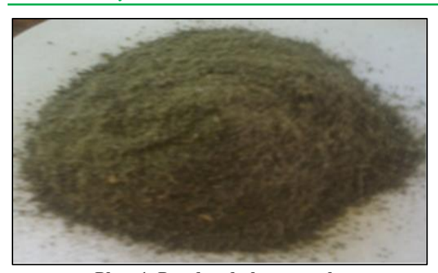
Plate 1. Powdered plant sample