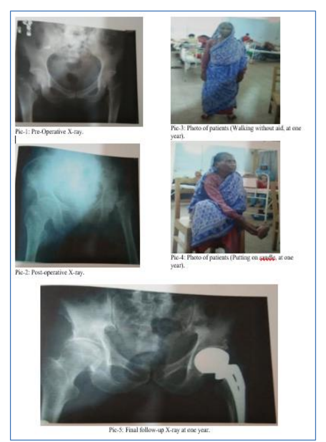
Fig-1: Some pic pre and post-operative X-ray follow up.

After data processing data were analyzed with the help of computer using computer based software SPSS (version 11.5). Data were analyzed and findings were presented in tables and figures as required. Statistical analyses were done by using McNemar Chisquare ( X^2 ) Probability Test.