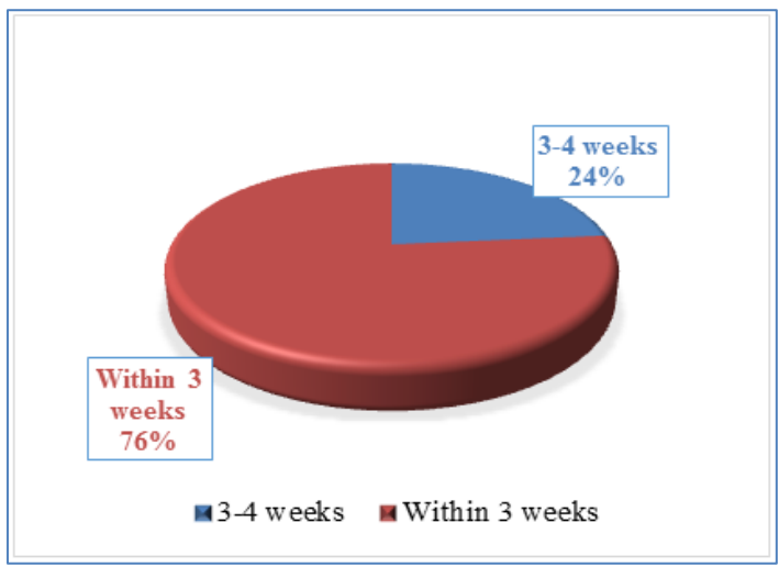
Fig-2: Distribution of patients by interval between injury and operation

within 3 weeks of injury, while the rest 24% were operated from 3 - 4 weeks after the incident of injury.