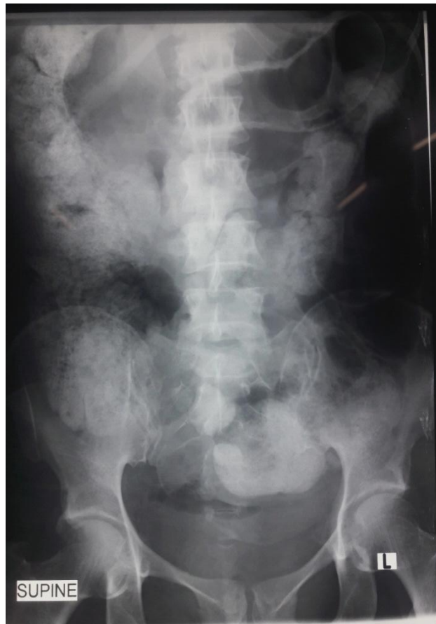
Figure-1: Supine abdomen radiography showed marked large bowel fecal loading with a mottled gas appearance and hyperlucency in the upper abdomen with gas outlining both sides of the bowel wall ('Rigler's sign') in keeping with intra-abdominal free air

hours after being transferred to ICU. Histopathology results of a resected colon revealed a perforation and ulcers along the anti-mesenteric border with features suggestive of acute ischemic necrosis.