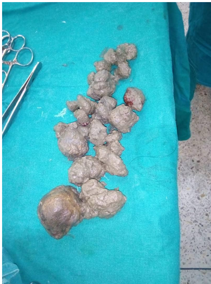
Figure-3: The image showing Fecalomas milked out through a stercoral perforation of HIV-infected patient who had longstanding history of constipation