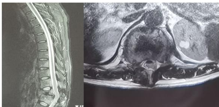
Fig-2: Iliopsoas abscess induced spondylodiskitis and local kyphosis.

The design and performance of this study conformed to ethical standards of Helsinki Declaration and our national legislation. It was approved by Medical Ethical Committee of our institution. The patient was enquired whether or not willing to take part in a scientific report and informed consent forms were signed by himself.