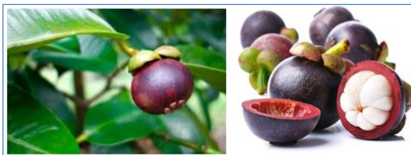
Fig-1: Mangosteen ( G. mangostana Linn) fruit (www.klikdokter.com, n.d.).

Mangosteen ( G.mangostana Linn) extract also showed antidiabetic activity (Darmawansyih, 2015; Maliangkay & Rumondor, 2018; Pasaribu et al. , 2012; Yusni et al. , 2017), antioxidant (Jung et al. , 2006; Supiyanti et al. , 2010), inhibition of human leukemia cell line HL60 growth (Matsumoto et al. , 2003), cytotoxic (Suksamrarn et al. , 2006), and analgesic (Cui et al. , 2010). The main component of G.mangostana rind is xanthenes, which are polyphenolic compounds. One of them is \alpha -mangostin (Aisha et al. , 2012).