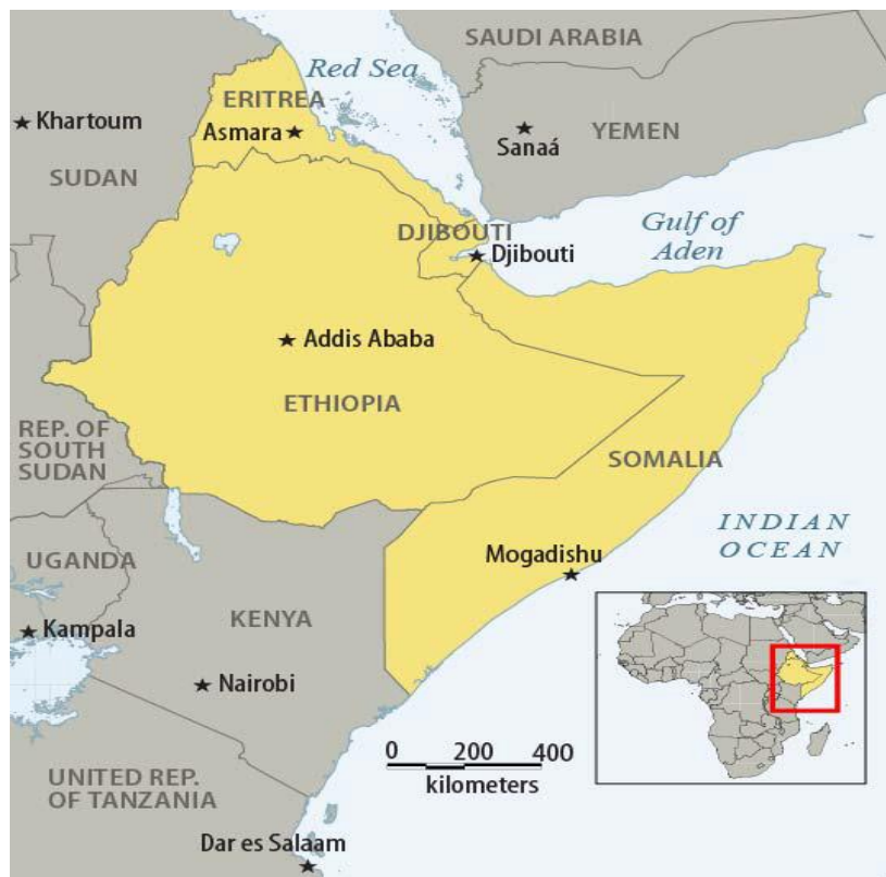
Fig-1: Political Map of the Horn of Africa Region

number of desperate people who risk their own lives and the lives of their children in a desperate attempt to get to Europe and other regions is appalling. In 2009, IOM estimated that up to 20,000 male Somali and Ethiopian migrants were being smuggled to South Africa from the HoA annually (Horwood/IOM, 2009). By the end of 2019, Somalia and Eritrea are the top 10 countries of origin of refugees globally. As of October 2018, an estimated 551,000 Somalians and 306,300 Eritreans were refugees in neighbouring countries (UNHCR, 2018). And many unfortunate have lost their lives on their way.