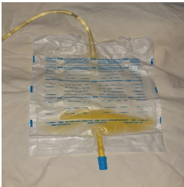
Fig-2: Clear urine after treatment with antibiotics