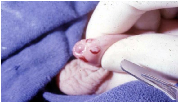
Fig-5: Small incisions started at the stenotic prepuce, with the open diamond wounds at operation

Starting at the most stenosed anterior area, several small (approximately 4mm) non matched superficial incisions of the skin and dartos are performed all around, until one reaches complete disappearance of the constriction, the skin remaining with multiple small open diamond wounds.