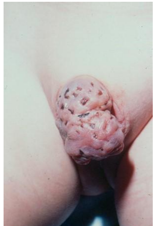
Fig-8: Overcoming of phimosis but still maintaining the full preputial skin

Edema may remain for several days, but when it completely fades away, then the penile look just looks normal and ..... with no phimosis.