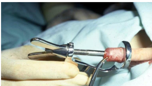
Fig-1: Circumcision, using a gadget for removal of the foreskin

The technique we suggest for the correction of phimosis while preserving the prepuce, is inspired in the mesh graft technique used in plastic surgery, namely in burns, when there is not enough skin available for grafting.