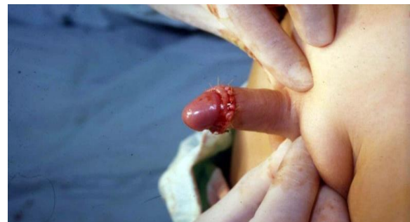
Fig-2: Final appearance, as in any “classical” circumcision, the skin being sutured with plain cat-gut

Significant Phimosis can be a motive for great anxiety both for the child and his parents, so it should be corrected as soon as the problem is detected. Some surgeons to assure a more perfect preputial removal prefer to use an appropriate device.