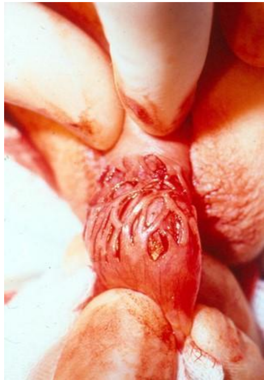
Fig-7: “Mesh graft” appearance of the wound

One tries to avoid damaging the dartos vessels but, if needed, electrocoagulation is used. In order to avoid restenosing of the prepuce, the penile skin immediately behind the open diamond wounds, is sutured to the pubo-scrotal skin and is to be maintained retracted at least a minimum of 5 days, to allow for complete healing (epithelialization) of the raw preputial surfaces.