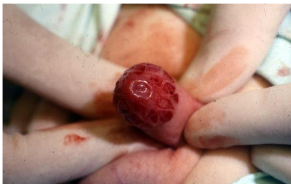
Fig-6: Progressively prolonging proximally the preputial skin incisions

One tries to avoid damaging the dartos vessels but, if needed, electrocoagulation is used. In order to avoid restenosing of the prepuce, the penile skin immediately behind the open diamond wounds, is sutured to the pubo-scrotal skin and is to be maintained retracted at least a minimum of 5 days, to allow for complete healing (epithelialization) of the raw preputial surfaces.