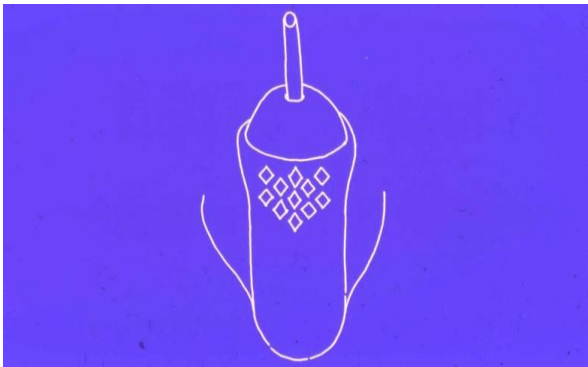
Fig-4: Schematic Drawing of the “opened” preputial incisions