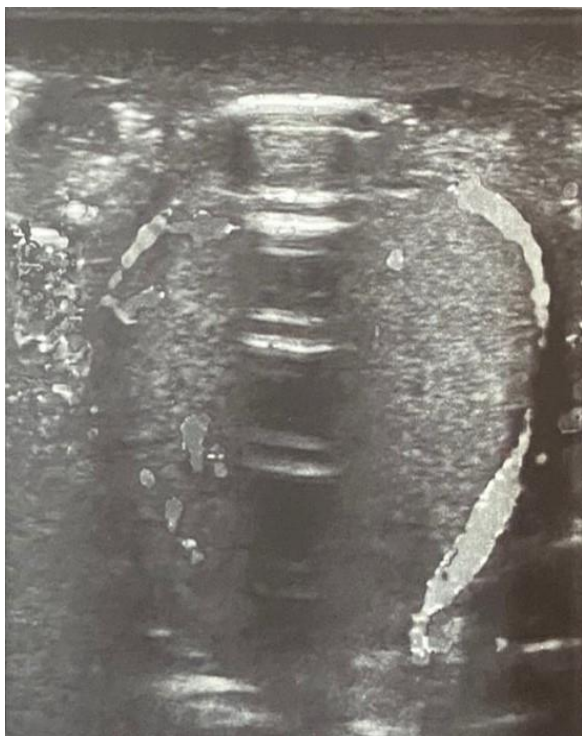
Fig 2: Ultrasonography of scrotum & perineum