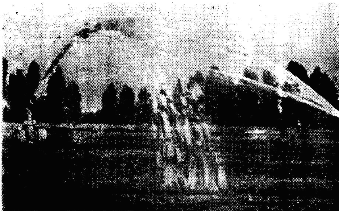
Fig.2 Demonstrations of the micro irrigation regime with the use of IDAH in conditions of irrigation of sugar beet, maize for power and soya in the Terter AIS of the Institute of "Agriculture".

Soaking of the soil during watering did not exceed 30-60 cm. Greater wetting and better uniform moisture distribution under these conditions is achieved with irrigation rates of more than 300-400 m 3 / ha. At such rates about 60-70% of water remains in the upper (20 cm) layer, and the plants are not completely supplied with moisture.