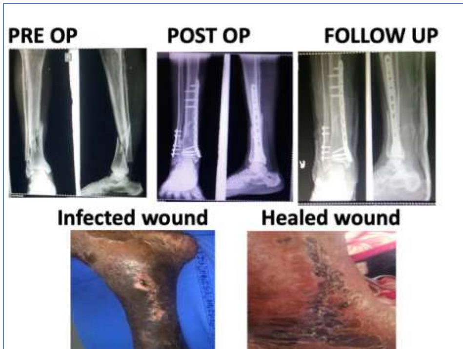
Fig-1: Showing preoperative, followup radiographs and scar images