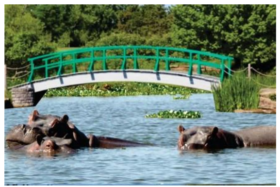
Fig-2b: Kalale Hippopotamus Pond (Proposed Site)

The image in Figure 3 below shows the Boziya plains and improved water ways for conservation. This site is of great natural attraction and will serves as source of water conservation to supports livestock production, fish production, game reserve development, pasture improvement and irrigation agriculture respectively. It has the potential support for rural economic and cultural development in Zamfara State. In fact, the cool down restive nerves over pasture resources from the month November/December livestock watering points usually becomes dried due to shortage of annual rainfall. In other words, this challenge has grossly hampered the management of livestock by semi-nomads in all year round pastoralists and agro-pastoralists.