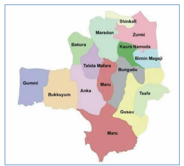
Fig-1a: The Map of Zamfara State