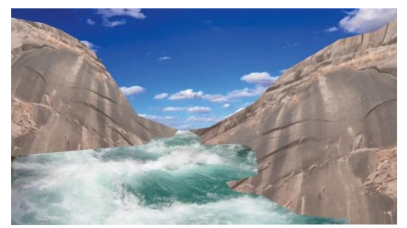
Fig-3: A Section of the Proposed Boziya Tourist Site and Water Conservation

The image in Figure 3 below shows the Boziya plains and improved water ways for conservation. This site is of great natural attraction and will serves as source of water conservation to supports livestock production, fish production, game reserve development, pasture improvement and irrigation agriculture respectively. It has the potential support for rural economic and cultural development in Zamfara State. In fact, the cool down restive nerves over pasture resources from the month November/December livestock watering points usually becomes dried due to shortage of annual rainfall. In other words, this challenge has grossly hampered the management of livestock by semi-nomads in all year round pastoralists and agro-pastoralists.