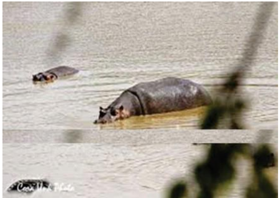
Fig-2a: Kalale Hippopotamus Pond (Old Site)