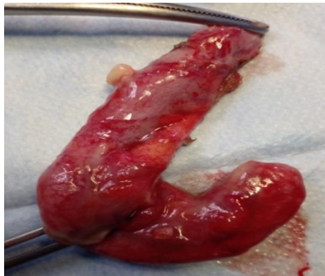
Figure 2: Removal of the appendix