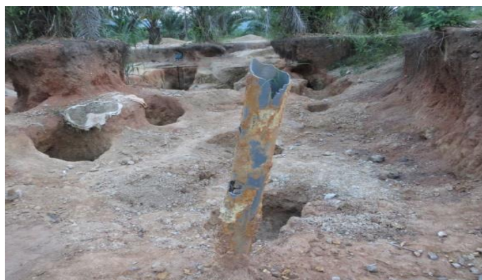
Photo 1: View of an artisanal gold mine

Organised in a pyramid, the relationship between landowners, mine managers and workers is as follows: "There are people who pay for the land like the big boss. At the top of the pyramid we have the landowners. "We pay taxes to have access to the mine in return for production packaged in bags. For a maximum of ten bags, three bags or two bags are destined for the mine owner, depending on the initial commitments. The latter (landowners), on a contractual basis, allocate and delimit areas, and regulate conflicts between mine managers and between gold miners.