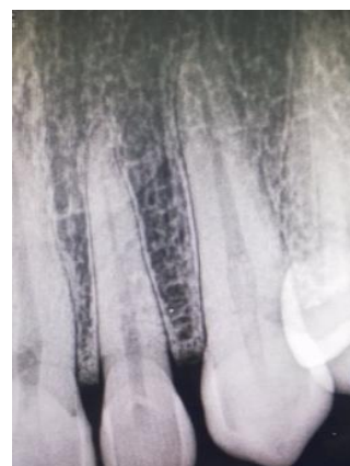
Figure 5: A tiny invagination which does not overextend the cement enamel junction

In order to deepen our clinical observation, we noticed an alteration of the morphology of the buccal aspect with a prominent cingulum a deep pit which was limited to the enamel on the contralateral lateral incisor [18] (figure 4) and both on the two upper canines. They were asymptomatic with no painful vertical and horizontal percussion.