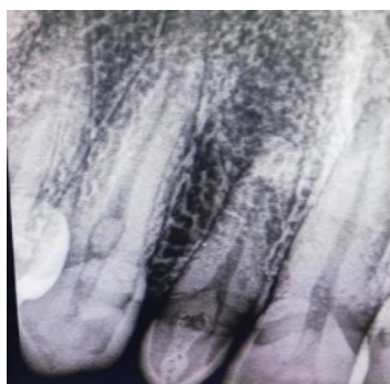
Figure 3: Retroalveolar radiograph showing an invagination structure exceeding the enamel cement junction on the 12 and opacity structure on the canine exceeding the enamel cement junction

Considering this atypical form of the cingulum, a dental invagination was suspected. A retro alveolar radiograph showed enamel opacity structure which suspect a type I of dens invaginatus on the lateral incisor and type II on the both canines [18, 13] (figure 5).