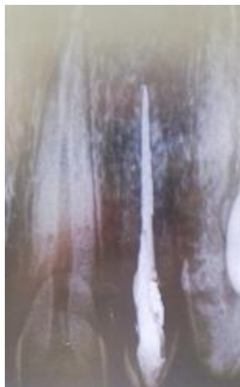
Figure 8: Root canal filling by gutta percha points and the adseal on the 12

On the second visit, after the removal of the provisional restoration and calcium hydroxide endodontic dressing, the canal was dried with sterile paper points and obturated with gutta percha and the adseal as a sealer (epoxy resin and calcium phosphate based sealer) (figure 8).