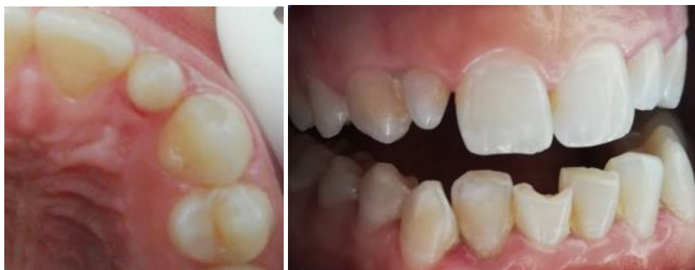
Figure 1 and 2: Preoperative photography of the clinical case, fusiform crown of the right lateral upper incisor [12]

A periapical radiograph from revealed the presence of enamel opacity structures invaginated exceeding the enamel cement junction and a periapical radiolucency associated with this tooth (figure 3). Based on this evaluation, the diagnosis for tooth was an acute apical periodontitis and a type II of dens invaginatus.