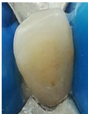
Figure 4: A deep pit which was limited to the enamel on the contralateral lateral incisor [18]

A Cone beam computed tomography was carried out as a complementary examination and to establish an appropriate care plan. It revealed on sagittal and coronal sections an abnormal crown and root canal morphology simulating a tooth inside the root canal of the 12 as well as a periapical radiolucency with a buccal cortex perforation apically of this lateral incisor.