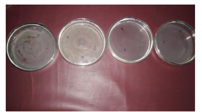
Fig-3: Agar plates showing susceptibility of Clostridium perfringes, Citrobacter freungii, kliebsella pneumonia and staphylococcus aureus through zone of inhibition against ethanolic extract of Ziziphus mauritiana