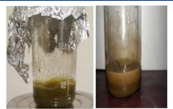
Fig-5: (A): Plant extract with AgNO<sub>3</sub> (B) after 24h in magnetic stirrer