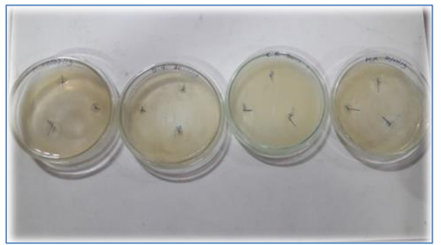
Fig-4: Agar plates showing susceptibility of Clostridium perfringes, Citrobacter freungii, kliebsella pneumonia and staphylococcus aureus through zone of inhibition against ethanolic extract of Coriandrum sativum