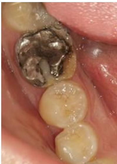
Figure 1: Initial situation of the right mandibular molar