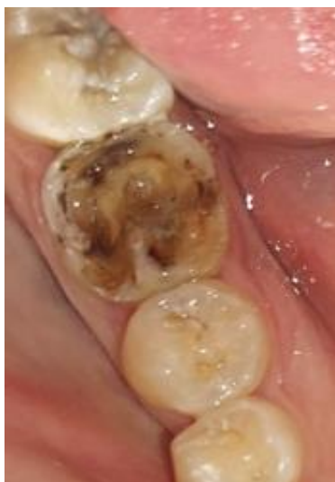
Figure 3: Occlusal view after removal of the amalgam restoration

(Figure 3). Then, all currently tooth restoration options were discussed: a direct restoration, an indirect partial restoration, a crown or a post retained restoration.