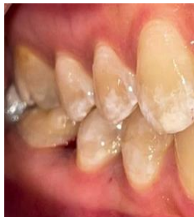
Figure 13: Final view arches in occlusion