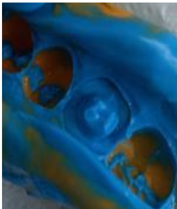
Figure 5: Mandibular impression with polyvinyl siloxane silicone

Polyvinyl siloxane silicone (Protesil, VANNINI, Italie) of light and heavy consistency was used with a simultaneous molding technique to take the impression, together with dual retractor cord 00 and 0 (Figure 5). The impression of the antagonist arch was taken with alginate. The upper and lower impressions were sent to the prosthesis laboratory.