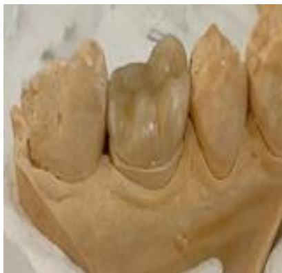
Figure 7: Vestibular view of the Endocrown in the master cast