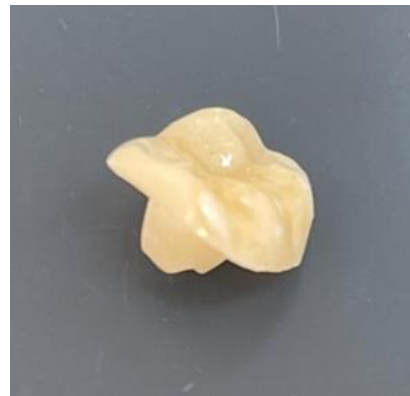
Figure 8: Endocrown fabricated from lithium disilicate-based ceramic (IPS e max CAD)