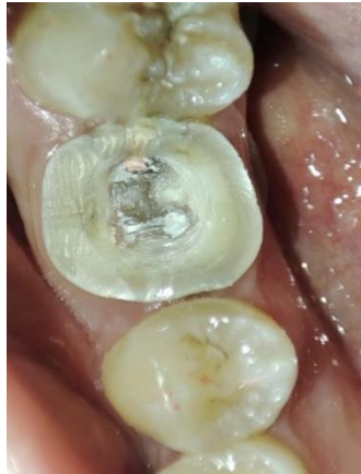
Figure 4: Occlusal view after the preparation

maintain the integrity of the canals' entrance (Figure 4).