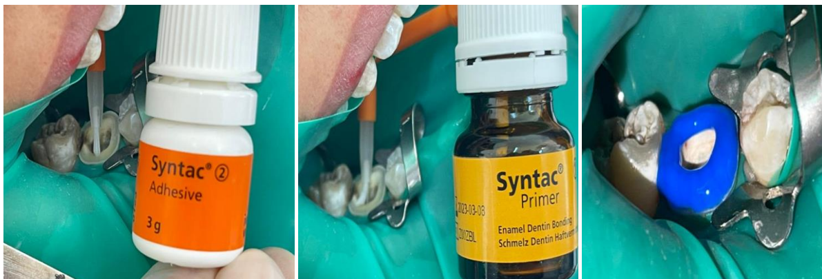
Figure 10: Conditioning of the prepared teeth: Selective enamel etching using phosphoric acid e and application of the bonding agent

inserted in position on the preparation, and polymerized at intervals of 5 seconds so that it is easy to remove cement excesses (Figure 11). The light activation was performed for 60s for each face. Some occlusal adjustments were necessary after cementation. The final result is shown in figure 12 and 13.