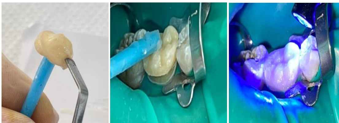
Figure 11: Application of the resin cement on the inner side of the prosthetic piece, positioning of the endocrown and photopolymerization