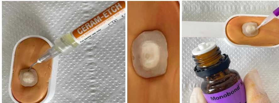
Figure 9: Conditioning of the ceramic endocrown: Etching using hydro fluoride acid and silane application on the prosthetic inner side

cleaned. The endocrown was tried in. The operative field was isolated. The internal surface of the prosthetic piece was treated with 9% hydrofluoric acid for 40s, washed with abundant water and dried, a coat of a silane coupling agent was applied for 1 minute and dried (Figure 9).