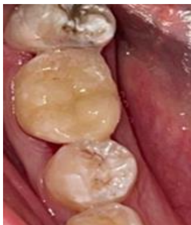
Figure 12: Occlusal view after the cementation of the endocrown