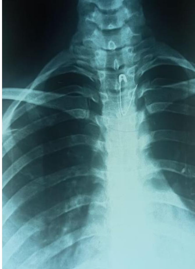
Figure 4: Antero-posterior chest X rays showing the hair pin in the oesophagus (white arrow)

level (Fig 4) and then at the digestive level, before migrating along the digestive tract (Fig 5) under close clinic and radiological monitoring until its expulsion in the stools. The control thoracic and abdominal X-ray showed the absence of the radiopaque pin.