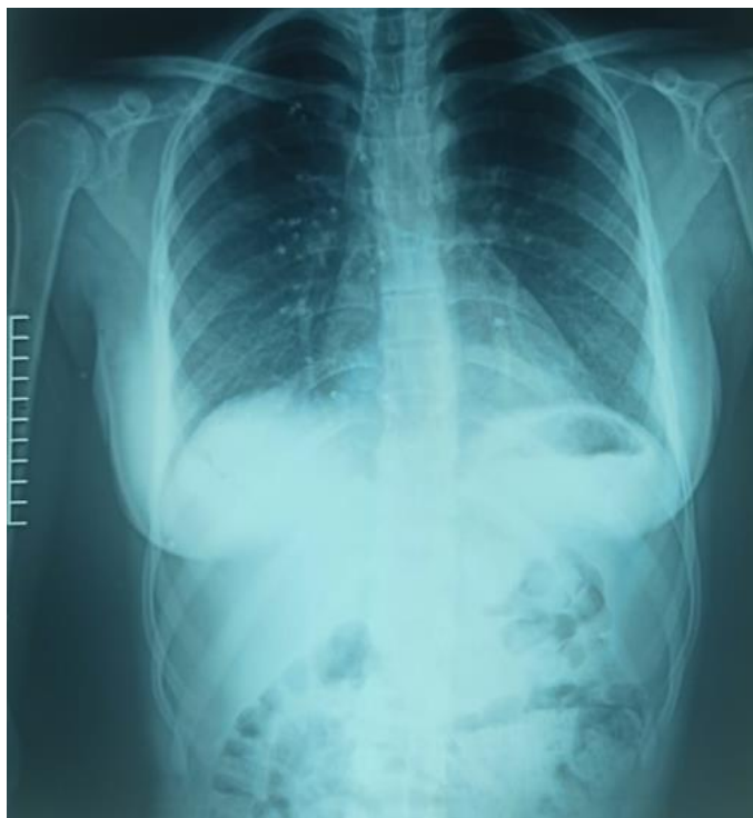
Figure 6: Thoraco-abdominal plain showing no hairpin