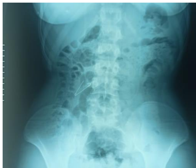
Figure 5: Abdominal plain film the pin projected to the right digestive area (white arrow)