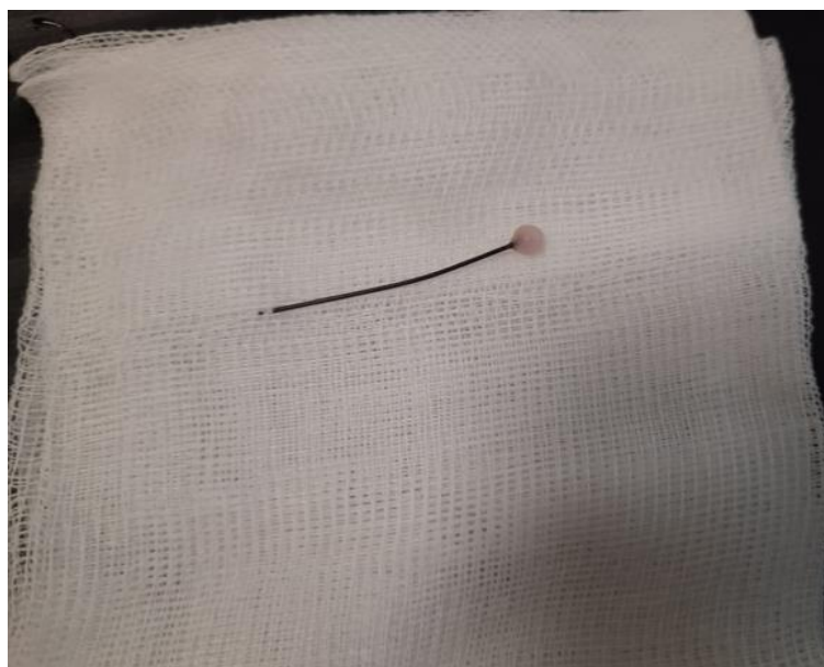
Figure 3: Extracted hairpin