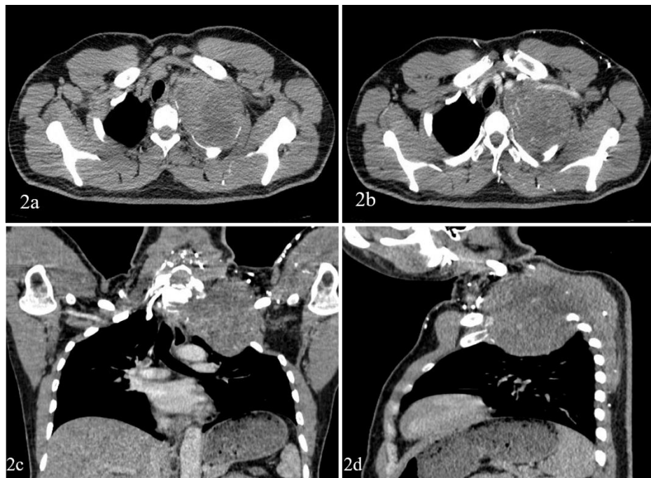
Figure 2: Chest CT. Unenhanced axial section (2a) showing a left apical heterogeneous soft tissue mass with hypodense areas within. There is lytic destruction and thinning of the first rib which outlines the mass posteriorly and laterally. The contrast-enhanced axial section (2b) shows prominent blood vessels within the mass and partial encasement of the subclavian vein. The coronal (2c) and parasagittal (2d) reformatted contrast-enhanced images illustrate the anatomical relationships of the mass