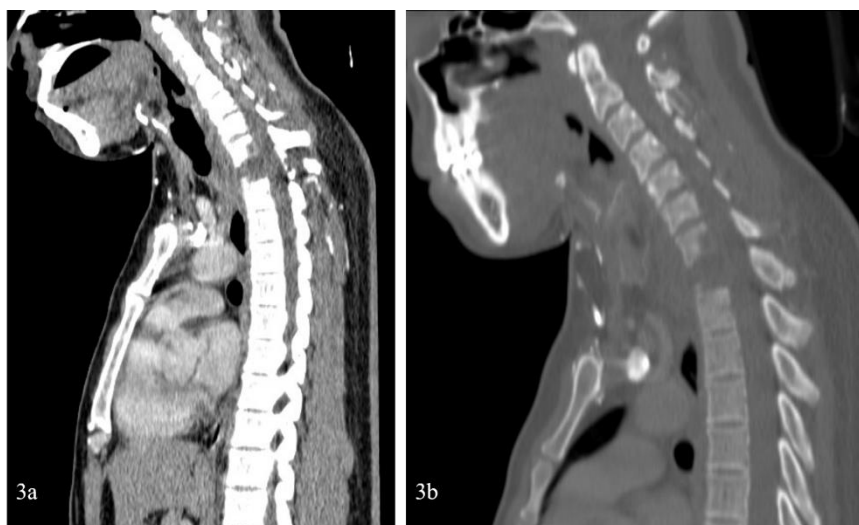
Figure 3: Midsagittal reformats of the contrast-enhanced series illustrate partial lysis of C7 and T1 vertebral bodies