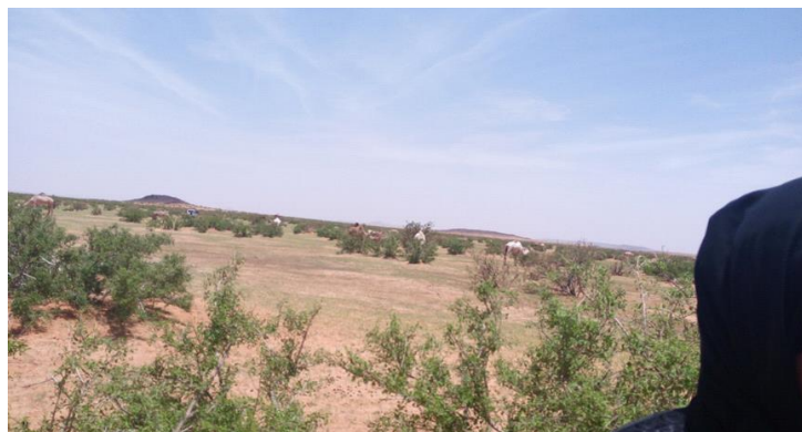
Plate 2: Some of camels in Al Koma area (North Darfur State) browsing the natural pasture