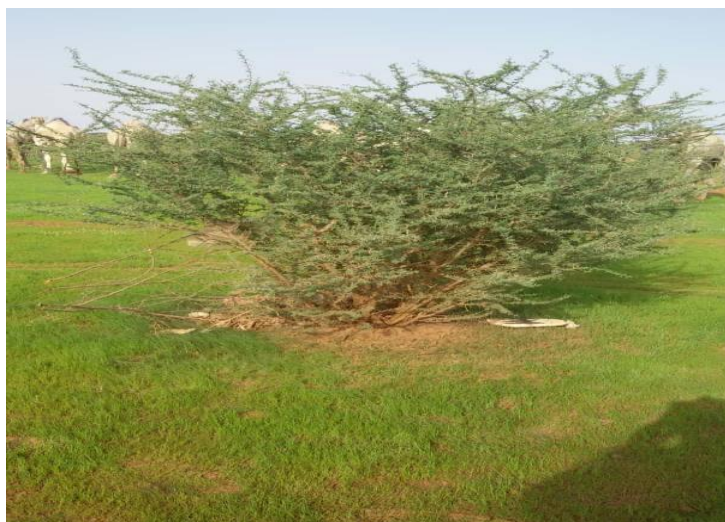
Plate 3: Camel browsing weeds and shrubs grown in Eastern Nile, Khartoum State