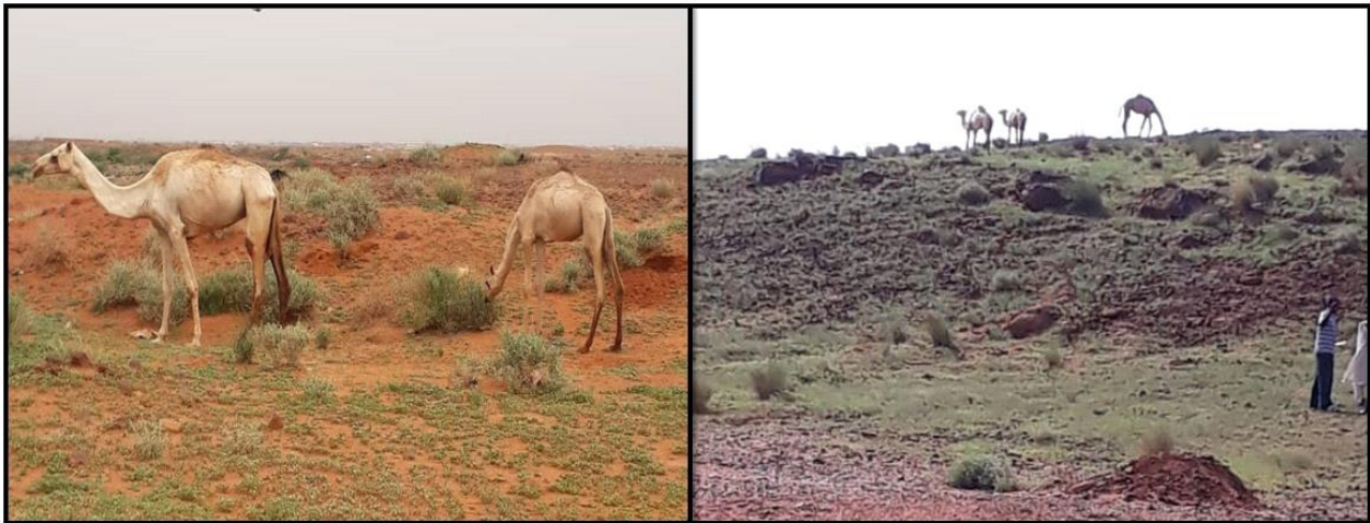
Plate 4: Camels utilizing at natural pasture in semi-nomadic system, Hamid Well area at West Omdurman (Khartoum State)