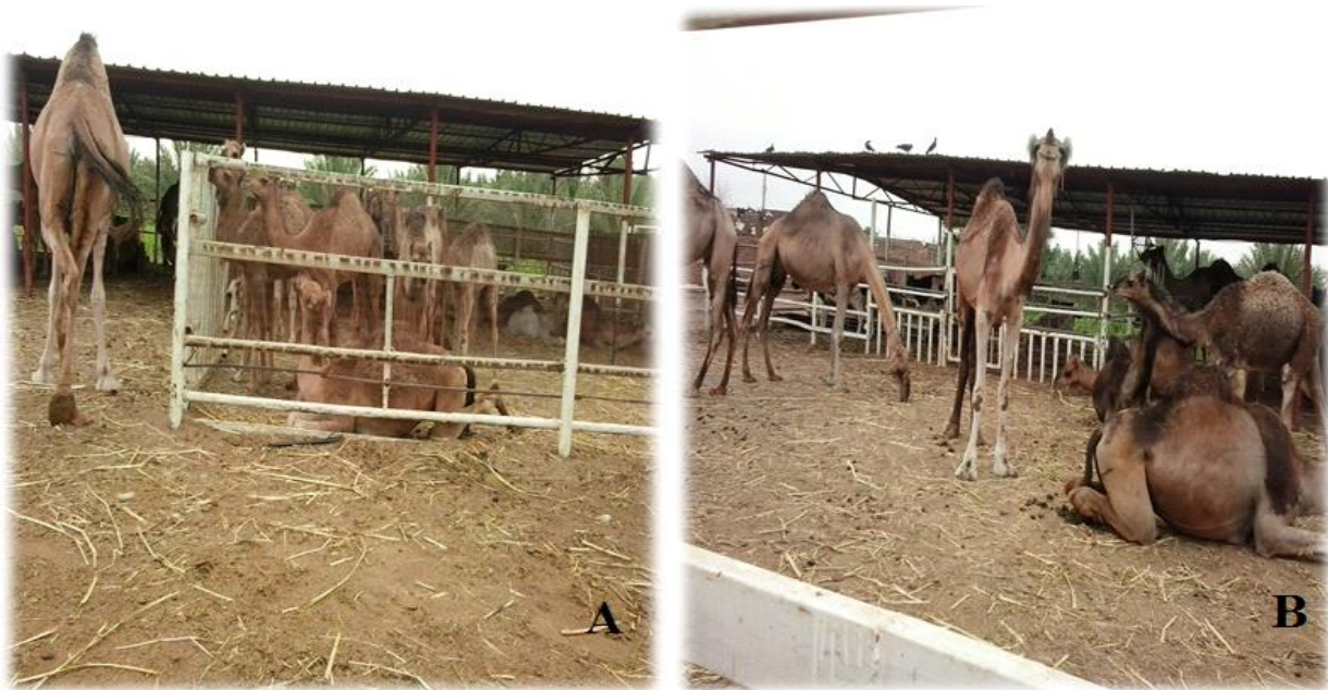
Plate 5: Camels rearing in the intensive system production System (Khartoum State)