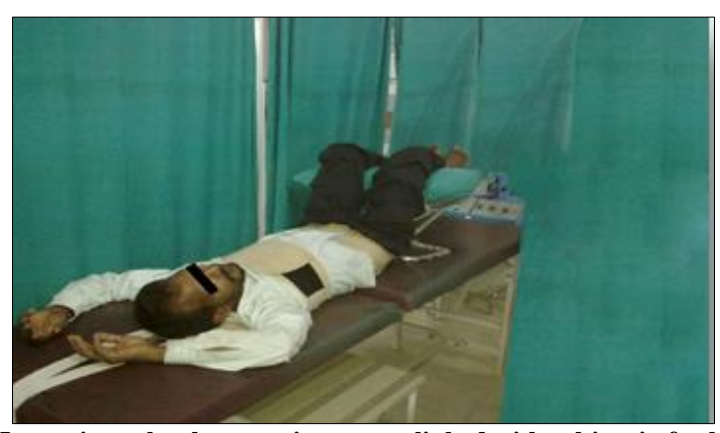
Figure 6: Intermittent lumbar traction on a split bed with subject in fowler position