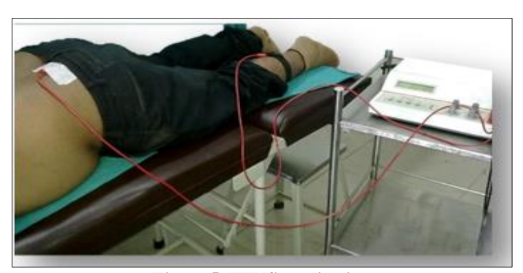
Figure 5: TENS application