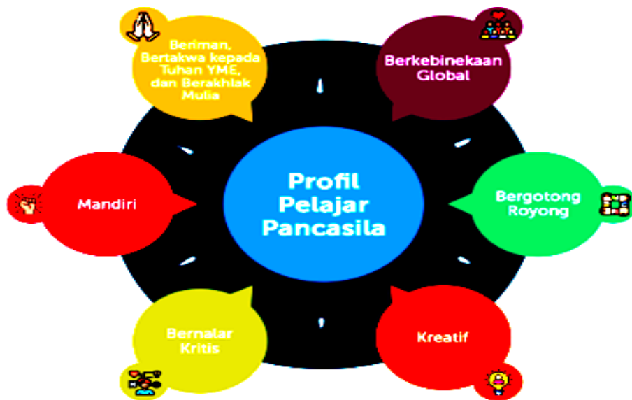
Gambar 2.3. Profil Pelajar Pancasila dan Enam Dimensinya (Panduan Kurikulum Merdeka, 2020)

intelligence, noble character, and skills needed for themselves, society, nation, and state" (Ministry of Education and Culture, 2022).