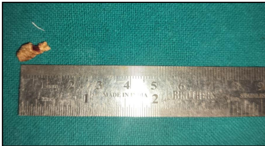
Figure 4: Surgically excised calcified