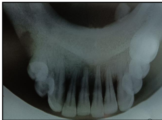
Figure 2: Occlusal Radiograph showing radiopacity

salivary gland tumours are among the differential diagnoses. An occlusal radiograph was advised which revealed an oval-shaped radiopacity adjacent to the lingual cortical plate of 35, 36 region (Figure 2).