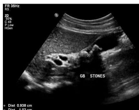
Fig.1: Showing distended gall bladder with multiple gallstones together with thickened edematous gallbladder walls.

tenderness and rigidity over right hypochondrium with positive Murphy's sign. Her all blood investigations including complete blood count, urea and electrolytes, liver function test and coagulation profile were within normal values apart from leukocytosis (WBC 13.600 \times 10^6/L ). Her abdominal ultrasound showed distended gall bladder with multiple gallstones together with thickened edematous gallbladder walls (fig.-1). The common bile duct and intrahepatic biliary radicles were reported to be slightly dilated without evidence of stones in the common bile duct. Her pre-operative chest x-ray showed the shunt tube in position (fig.-2)