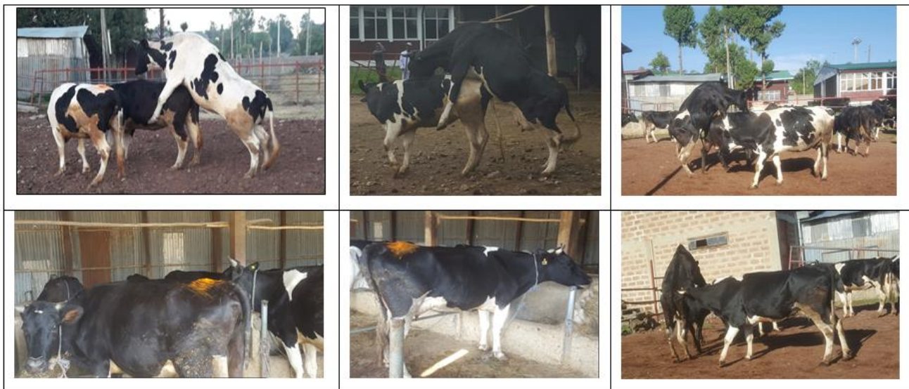
Figure 3: First batch synchronized animals manifesting behavioral estrus sign