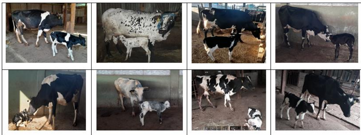
Figure 5a: Heifers born from sexed semen give female calves (seedstock) after estrus synchronized and inseminated with sexed semen (F2)