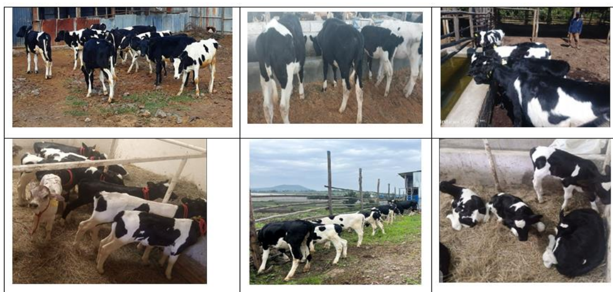
Figure 4: Calves born on research station and private dairy farm using sexed semen (F1) at DZARC

HF: Holstein Friesian breed; B=Boran Breed