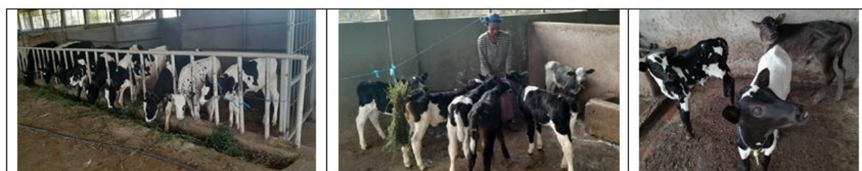
Figure 5b: Collective figure for female calves born from whose mothers were born with sexed semen (F2) at DZARC