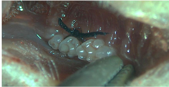
Image 1: A ligature composed of silk suture material (6-0) was placed around the maxillary second molar (M2) to induce bacterial accumulation and dysbiosis, resulting in gingival inflammation and bone resorption after 10 days. The ligature was observed under a microscope at 8x magnification