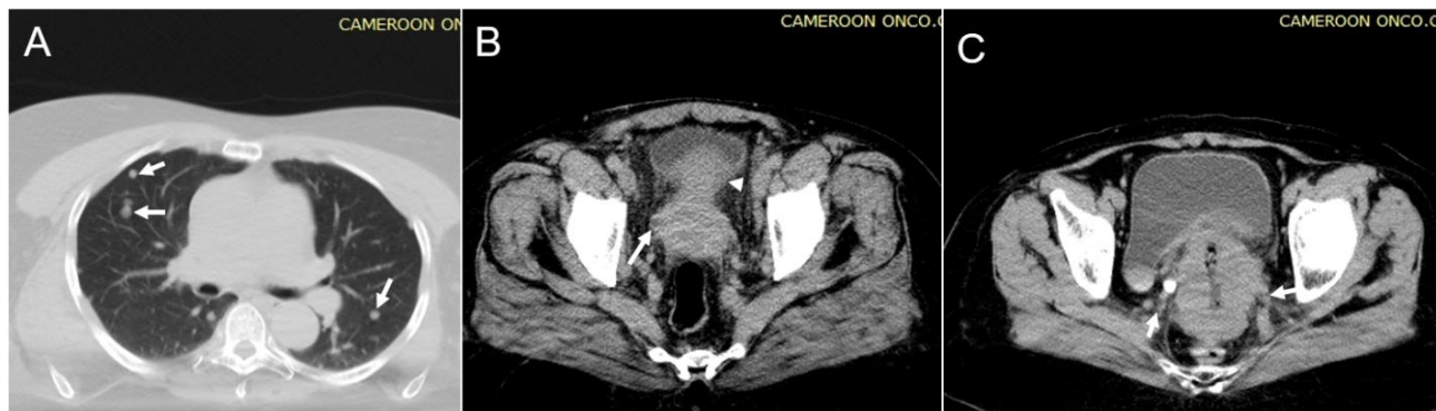
Figure 4: A: Axial CT scan of a 72-year-old woman with epidermoid carcinoma of the uterine cervix. Lung window shows disseminated lung nodules (arrows) of different sizes in a random distribution. B: Axial contrast-enhanced CT of a 62-year-old woman with epidermoid carcinoma showing a bulky uterine cervix with mixed attenuation and irregular margins. There is invasion of the bladder neck (arrowhead) and peri-ureteral fat (long arrows) with ureteral dilatation. C: Axial contrast-enhanced CT (late phase) of a 53-year-old woman with squamous cell carcinoma of the uterine cervix showing a bulky uterine cervix with irregular margins and nodular thickening of the parametrium (arrows)