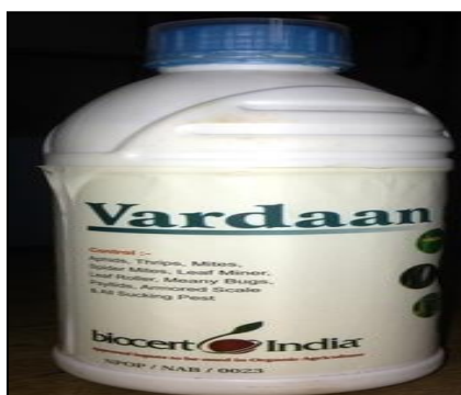
Fig-1:Packet of the insecticide alleged to have been consumed by the patient

A 40-year-old male presented to the emergency department with alleged history of having deliberately consumed about 500 gm of an insecticide Lambda-cyhalothrin (Fig-1). He had excessive salivation, fatigue, high cough and abdominal pain, following consumption of the poison. He had no previous medical comorbidities.