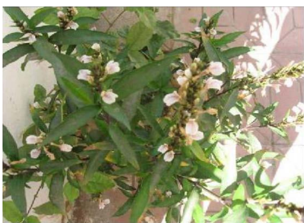
Fig-3: Gandarussa Flowers [2].

J.gendarussa is one of herbal plants used in the Ayuverda medical system. Ayuverda is one of the traditional healing methods that have been used for a long time. Ayuverda treatment helps to restore balance between body, heart, mind and environment. Treatment with the Ayuverda system can be started by consuming herbal ingredients, yoga, massage therapy, and meditation [3].