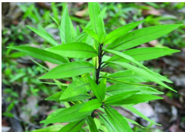
Fig-2: Gandarussa leaves [2]