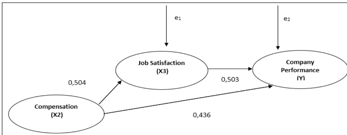
Fig-3: Path analysis of the influence of X2 on Y through X3

Based on the partial path analysis above, path analysis can be described between compensation to company performance through job satisfaction with the sub-structure image as follows.