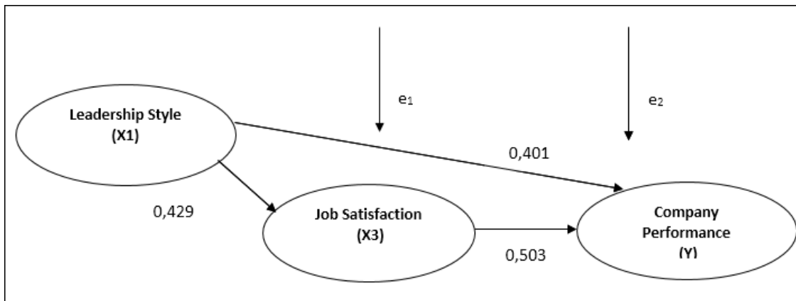
Figure 2. Path analysis of the influence of X1 on Y through X3

Based on the picture above, it can be seen that the influence of leadership style on company performance is 0.401. The influence of leadership style on company performance through job satisfaction is 0.429 \times 0.503 = 0.216 . In this case, the direct effect is greater than the indirect effect, so it can be said that the job satisfaction variable is not intervening.