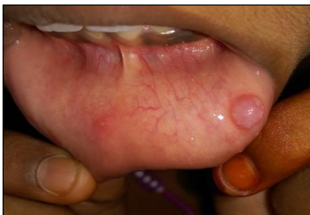
Fig. 5: Mucocoele