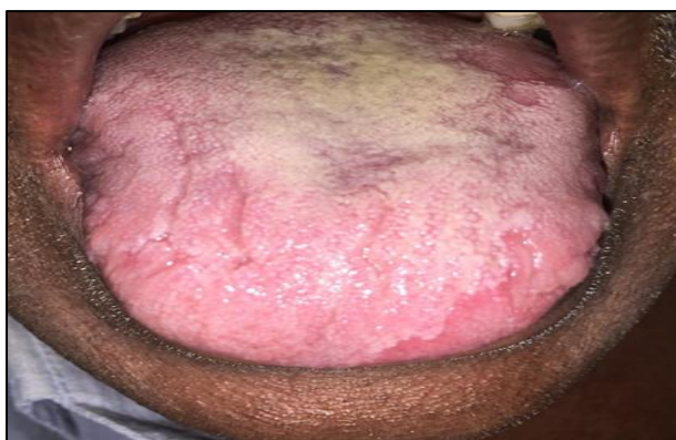
Fig. 2: Oral Candidiasis with Geographic and Fissured Tongue