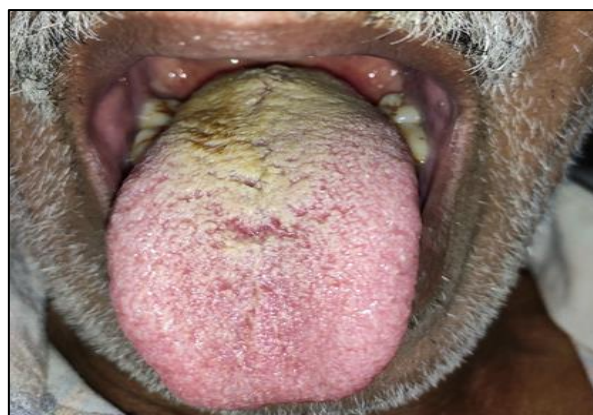
Fig. 6: Hairy Tongue