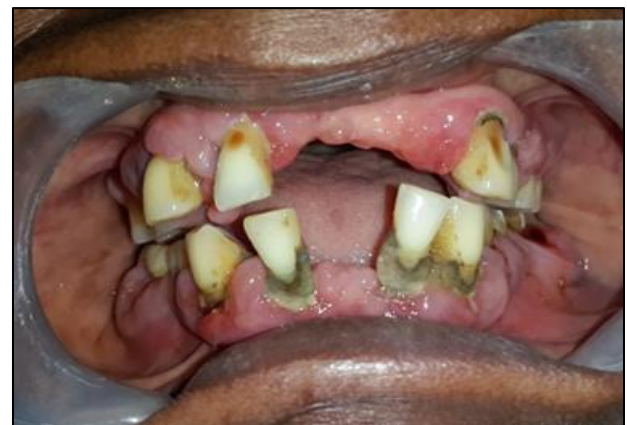
Fig. 1: Periodontitis

The most commonly occurring manifestation was periodontitis (64.9%) followed by fissured tongue (21.1%), xerostomia (19.8%), candidiasis (16.6%), burning mouth syndrome (12.8%), taste alteration (11%), angular cheilitis (4.9%) oral ulcers (2.7%), sialadenosis (2.2%), oral lichen planus (1.9%), sialorrhoea (1.8%), geographic tongue (1%) , mucocoele (0.7%) and hairy tongue (0.5%) in descending order ( Fig. 1-6 ).