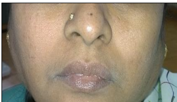
Fig. 4: Sialadenosis