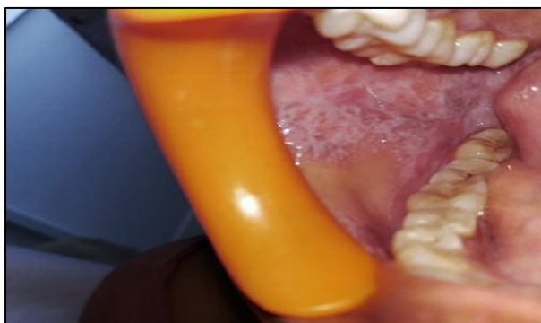
Fig. 3: Oral Lichen Planus