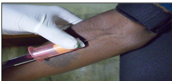
Figure 1: Collection of blood sample