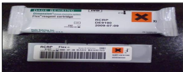
Figure 3: Reagents used for estimation of serum CRP levels

Serum levels of CRP were quantified using a high sensitivity CRP enzyme-linked immunosorbent assay (hsCRP ELISA). A reagent † was used to quantify the levels of CRP (Figure 3).