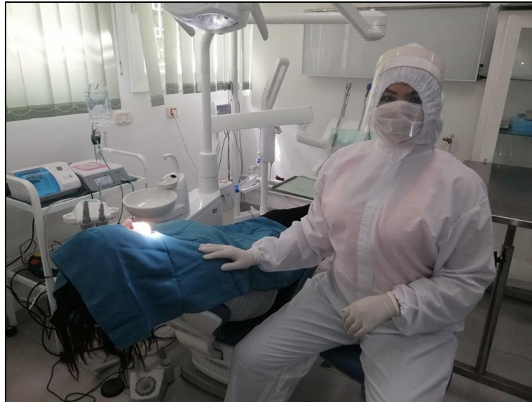
Figure 1: Protective equipment to ensure the safety of the medical staff