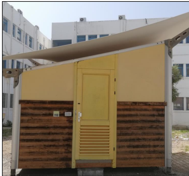
Figure 3: Sorting unit at the hospital-university of dental clinic of Monastir