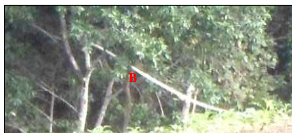
Photo 2: tapped water in pipes (B) from the slopes through the forest into the farms

FGD participants pointed out that the general inadequate irrigation infrastructure is compounded by climatic variability which impacts negatively on streams, rivers and even farm reservoirs. An agricultural personnel in the field explained that water scarcity associated with climatic variability and farmers inability to generate on-farm irrigation schemes and the use of water pumping power-driven machines, have been supplemented with drip irrigation to minimise the available water. Field observation revealed that rural farmers were generally inclined to adopting irrigation techniques, but the efforts were imperilled by poverty and inaccessible roads to purchase and transport irrigation requirements such as drip-sets and pipes from the market to the farms.