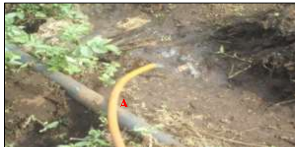
Photo 1: uncontrolled conduit resulting in continuous water flow leading to soil erosion (A) and gullies

lead to in-farm soil erosion (plate 1). Pipes and water storage devices such as tanks and troughs are expensive to obtain and even if they are provided, maintenance remains challenging.