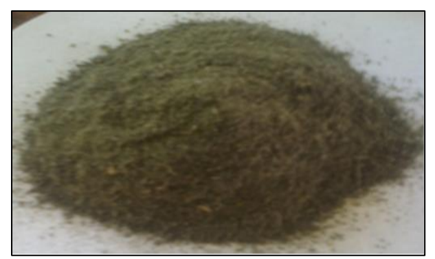
Plate 1. Powdered plant sample