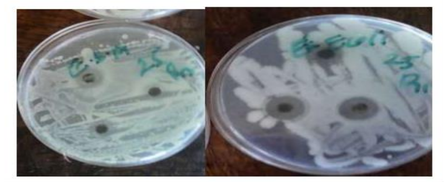
Plate 4. Showing growth inhibition zones of ethanol extract on S. aureus and E. coli respectively at 250mg/ml.