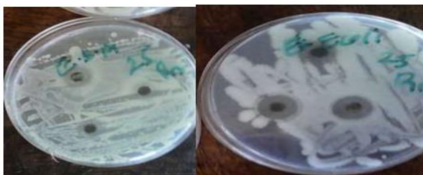
Plate 4. Showing growth inhibition zones of ethanol extract on S. aureus and E. coli respectively at 250mg/ml.