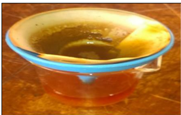
Plate 2. Filtrate of aqueous leaf extract