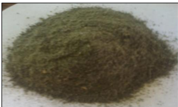
Plate 1. Powdered plant sample