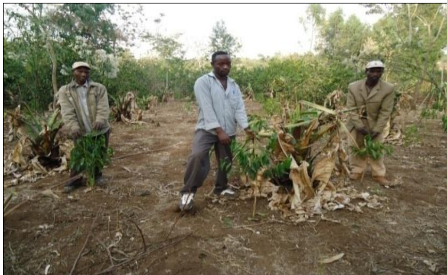
Fig. 2: Farmers demonstrating their specialty coffee seedlings

varieties. The current study result revealed that the mean survival rate of specialty coffee seedlings in both zones is more than 90% indicating a good survival rate under farmers’ management. In addition, it can be observed that the average survival rate of specialty coffee seedlings in Sidama region, is more than the one reported in different Woredas of Gedeo. With the exception of mixing local coffee variety with others on one plot of land, observed on 5.04% of the observations, other parameters such as spacing and shade tree application were successful and applied as per the objective of WGARC. Hence, on different plots, researchers have observed good seedling quality and growth status like in the picture below: