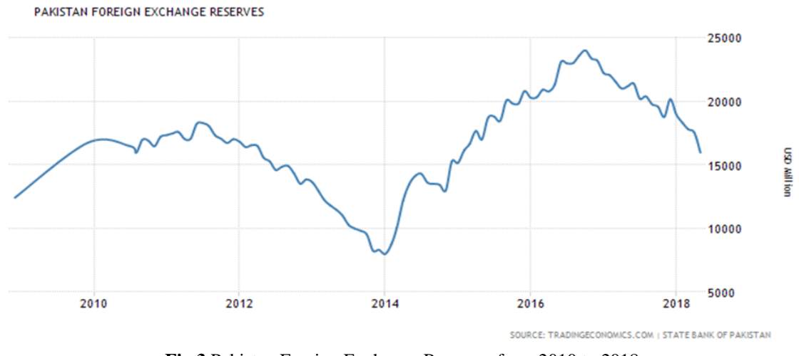
Fig.3 Pakistan Foreign Exchange Reserves from 2010 to 2018